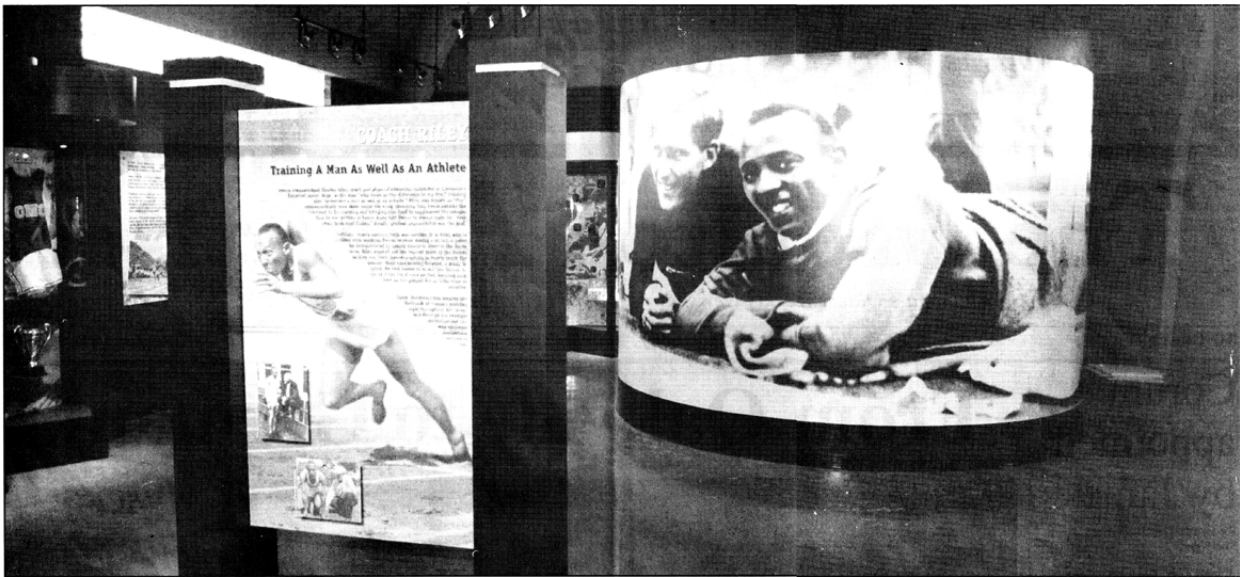
The picture of Jesse Owens and German runner Luz Long (right) is one of the most recognized photographs in the world. The picture is at several locations in the museum.