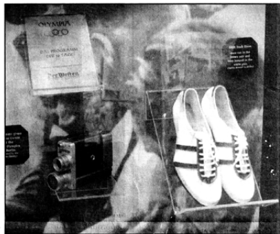
The 1936 Olympic program and camera used by Jesse Owens at the games were donated by the family. The shoes are a replica.

"He's known worldwide and respected by a lot of people in Germany," he said. "I've talked to a lot of German people and they don't want to talk about Hitler. They want to talk about Jesse. I have yet to find one person who doesn't know Jesse Owens. That says something about his legacy."