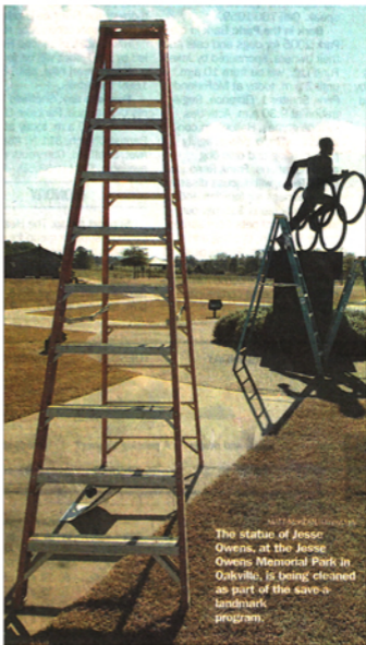
The statue of Jesse Owens, at the Jesse Owens Memorial Park in Oakville, is being cleaned as part of the save-a-landmark program.