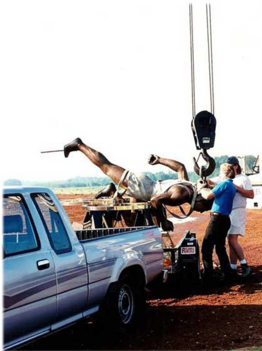
A crane was used to hoist statue to its base.