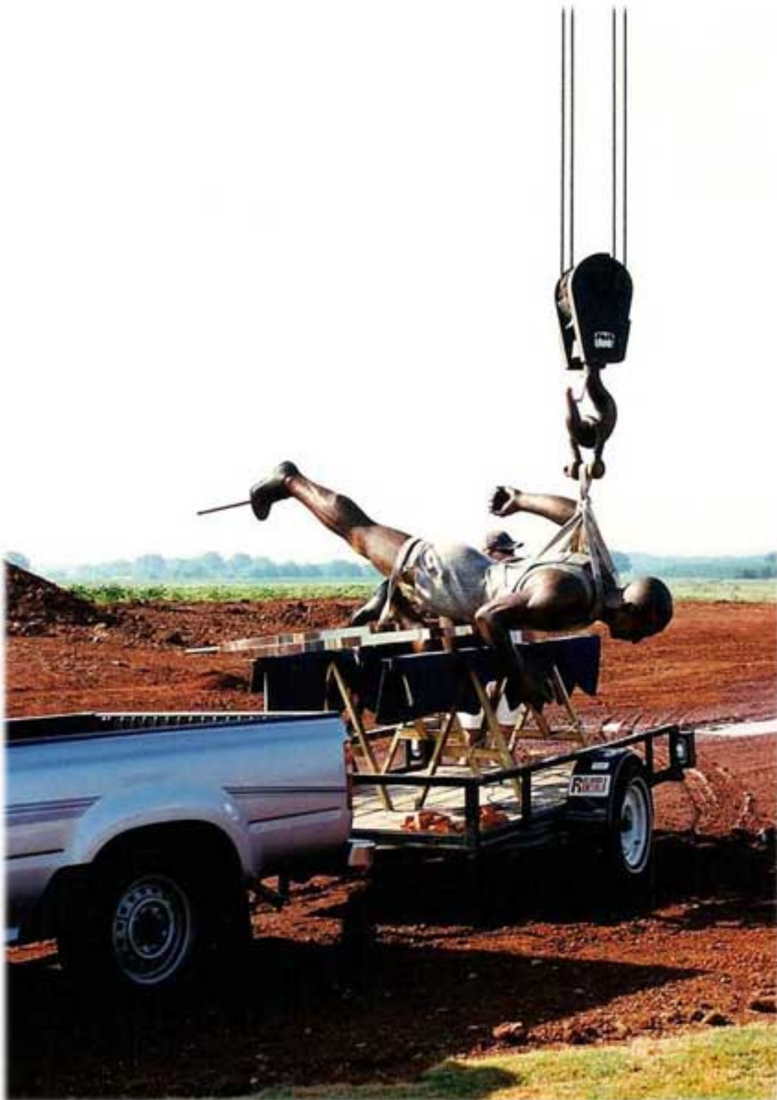
Statue being lifted from trailer.