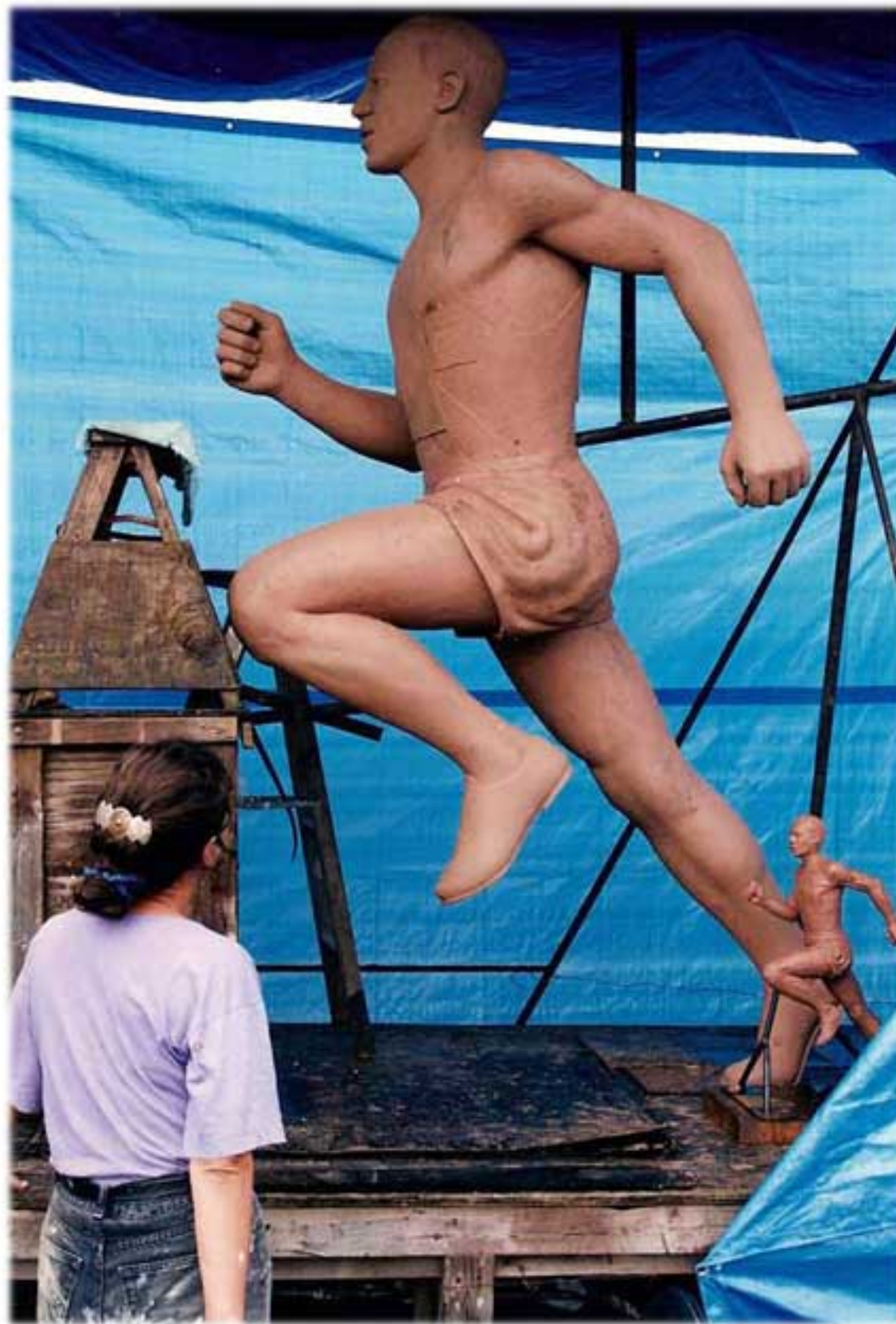
Plaster form for the Jesse Owens' statue.