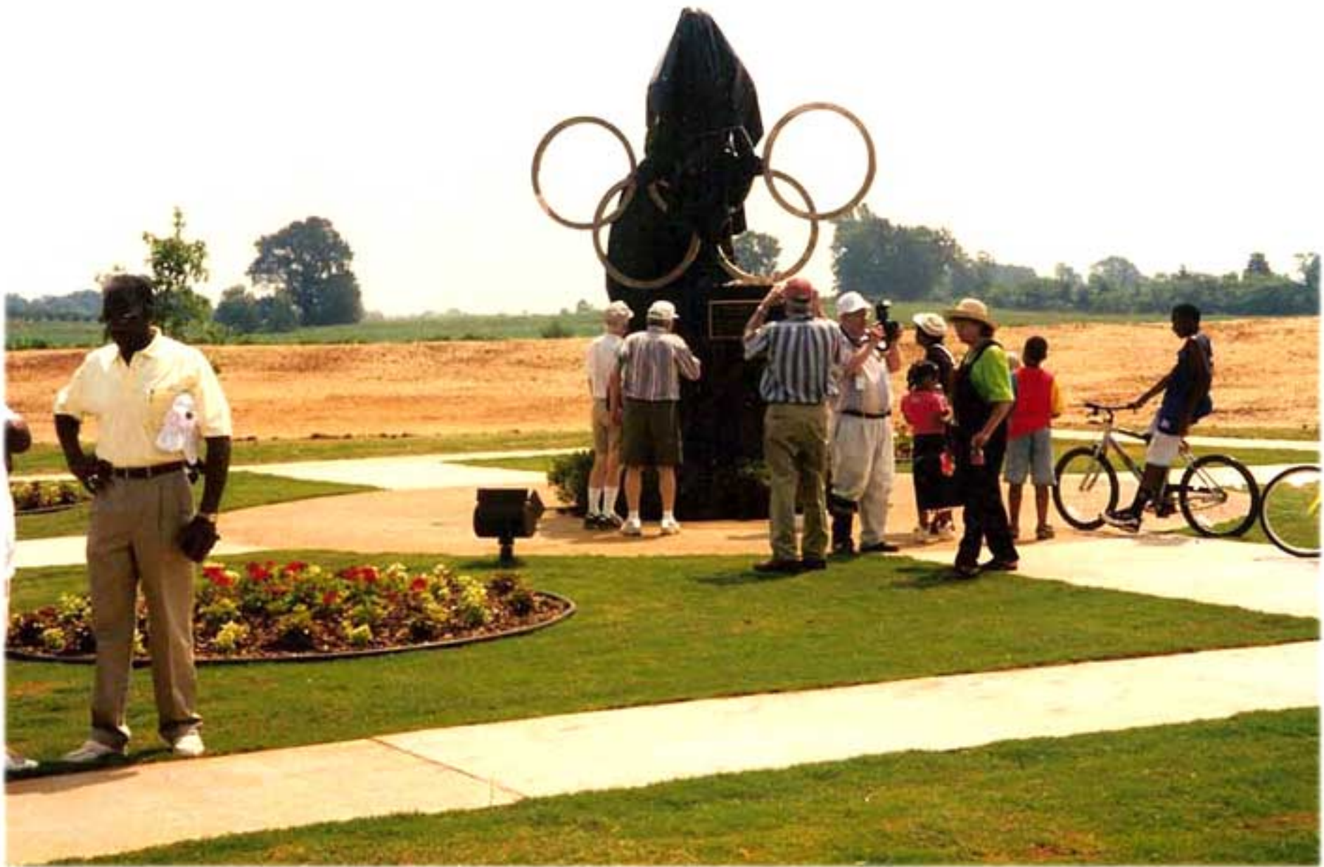
Crowd starting to gather for the statue dedication.