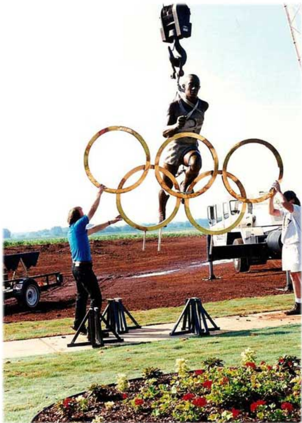
Statue placed on temporary holders.