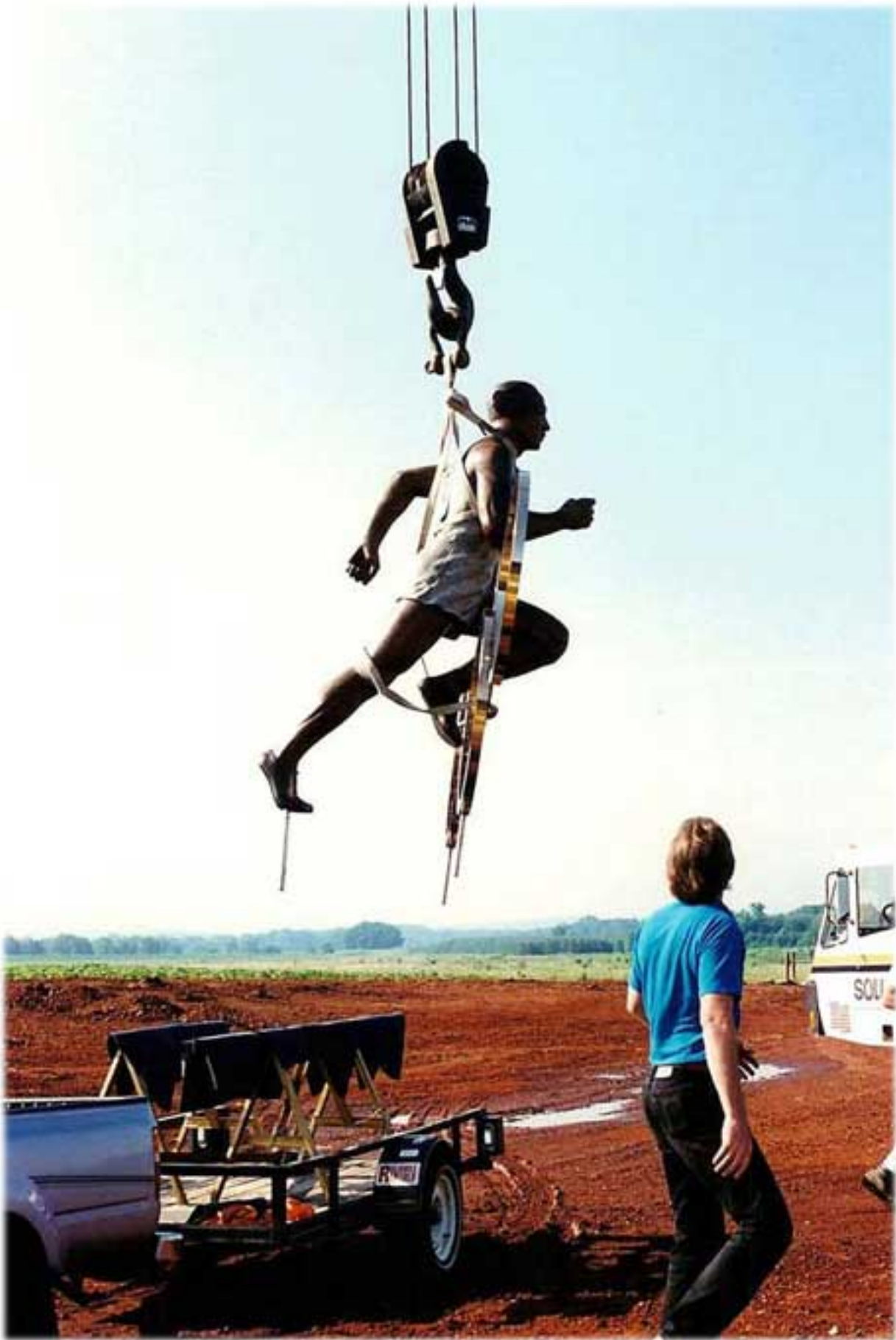
The statue as it is being installed on base. It seems to be running to its home base.