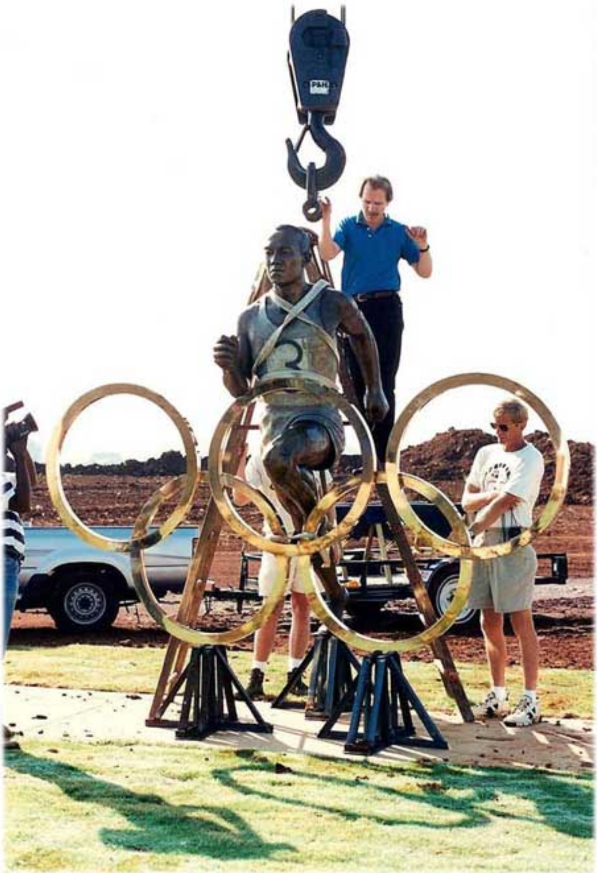
Strapping the statue securely to be hoisted onto its permanent base.