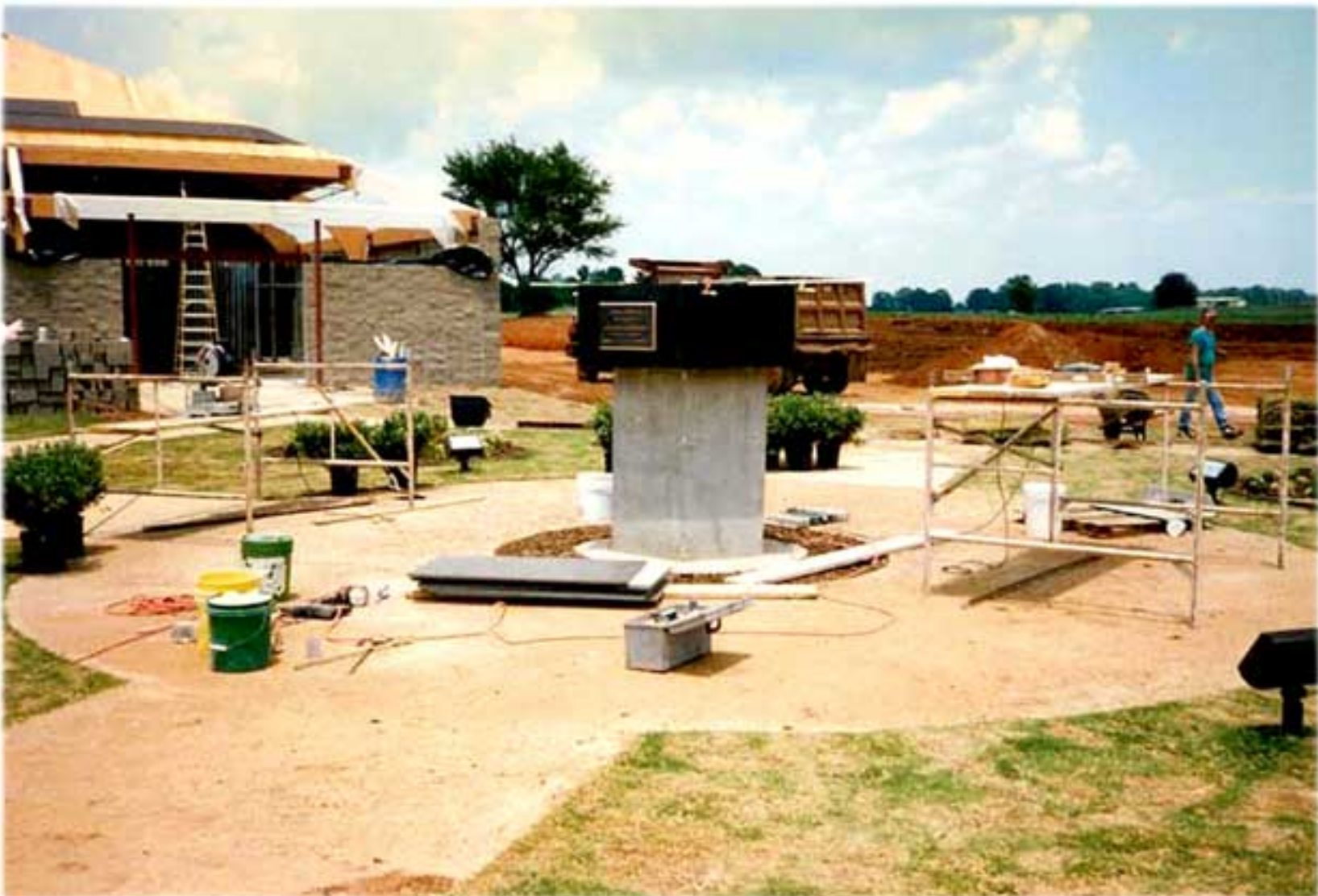
Statue base made of solid concrete with a granite veneer cover and plaque.