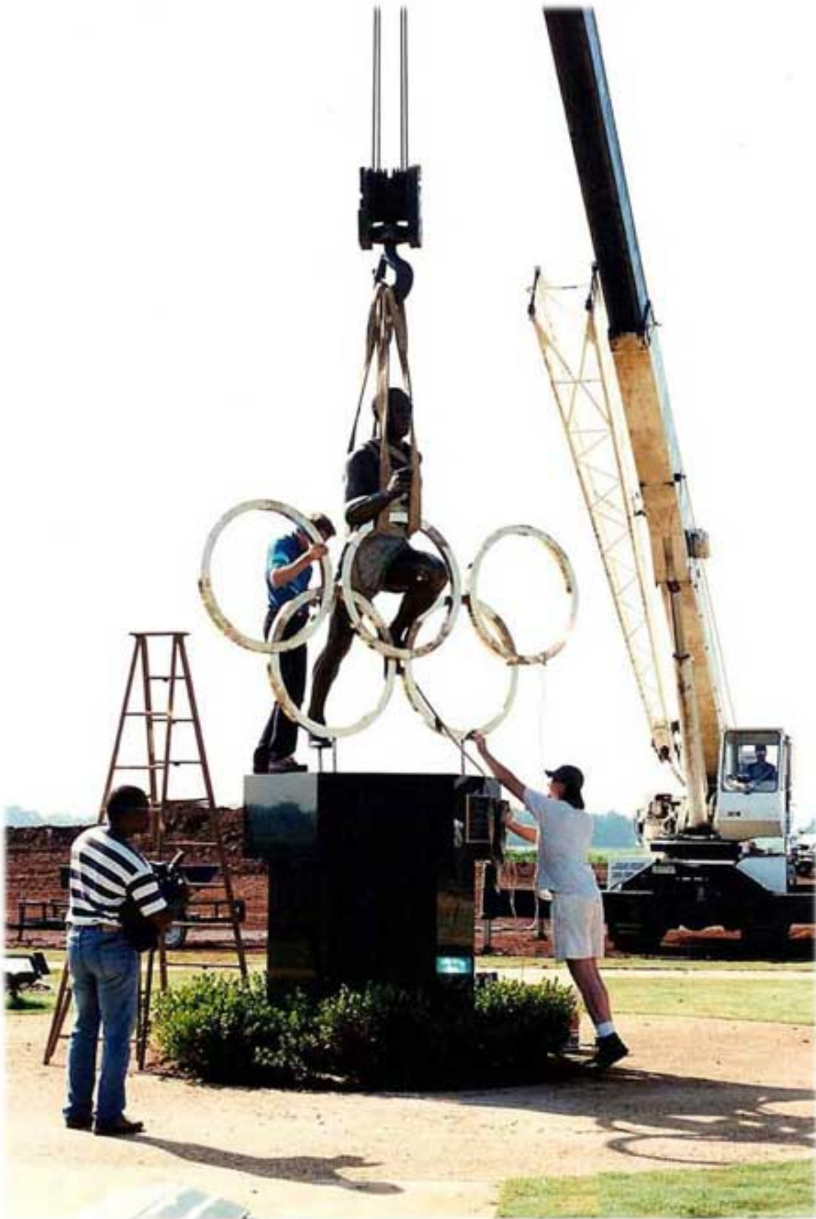
Statue being permanently anchored on its base.