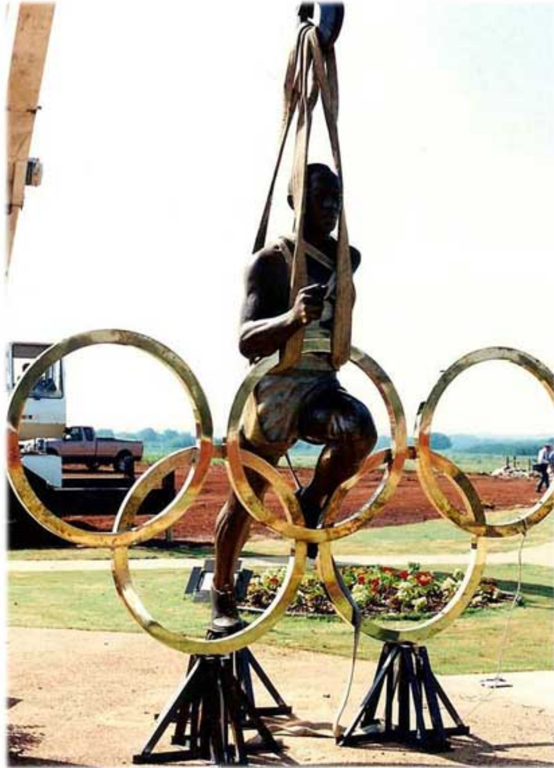
Statue ready to be hoisted by crane operator.