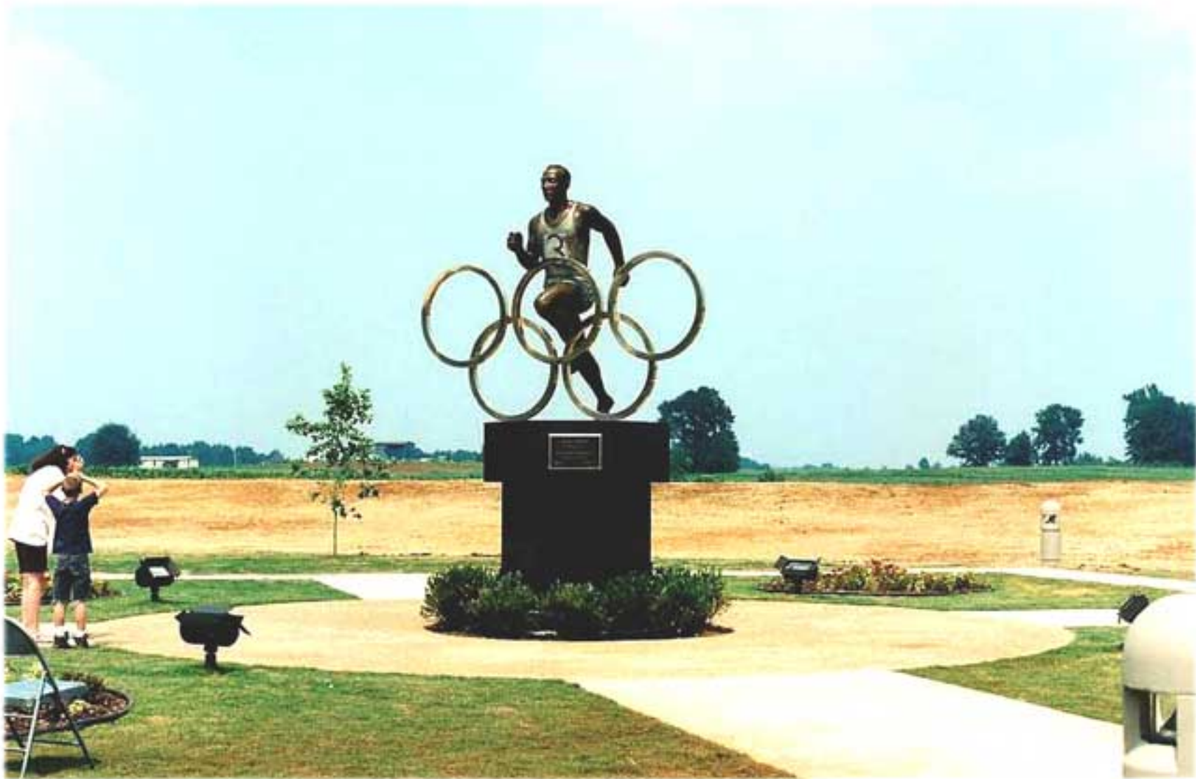
Statue is completed and ready for visitors.