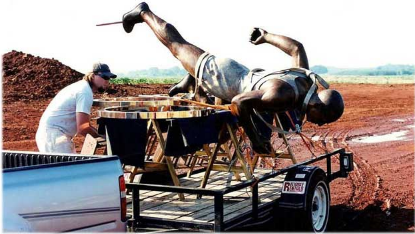
Statue arrives at the park from Birmingham. Branko (blue shirt in bottom photo) getting the statue ready to hoist to base.